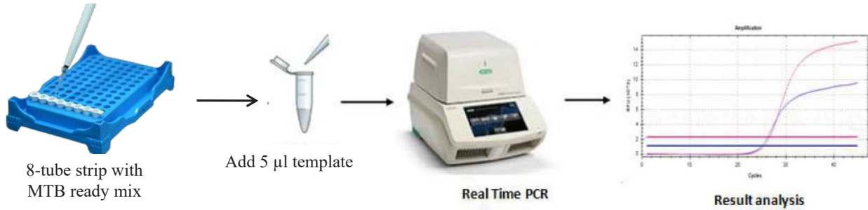
Supplementary Figure. Process Flow for Quantiplus® assay for detection of MTB from sputum (A) DNA extraction from sputum specimen, and (B) RT-PCR protocol.