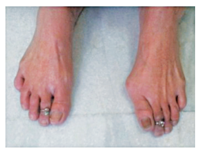
Fig. 3. Striatal deformity of left foot characterized by big toe lateral flexion in a Parkinson's disease patient (66 yr old female).

wearing off dystonia. Misdiagnosis of these deformities as rheumatoid or some other types of arthritis is very common.