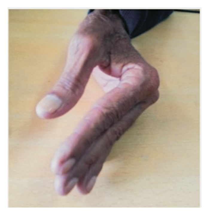
Fig. 2. Striatal deformity of left hand characterized by flexion at metacarpophalangeal joint in a Parkinson's disease patient (71 yr old male).

Striatal hand deofrmities include flexion at metacarpophalangeal, proximal interphalengeal and distal interphalangeal joints. Striatal foot deformities are characterized by extension of great toe and plantar flexion of other toes. There may be associated claw like or talipes equinovarus like deformities. Intitially these deformities may be non-fixed but later on these become fixed. Striatal deformities might be present in up to 10 per cent of untreated cases of advanced PD and these are more common in early onset or younger PD patients (PARKIN mutation)<sup>23</sup>. These deformities may be responsive to levodopa and may be a part of