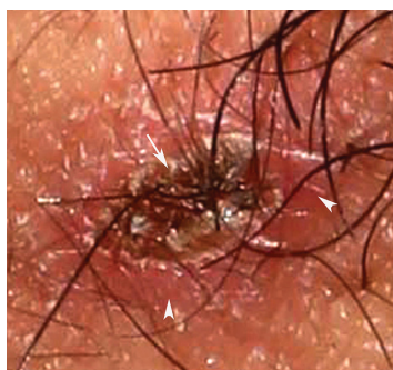
Fig. 1. Black crusted eschar surrounded by an erythematous halo in the right axilla, a pathognomonic finding in the scrub typhus (arrows head).