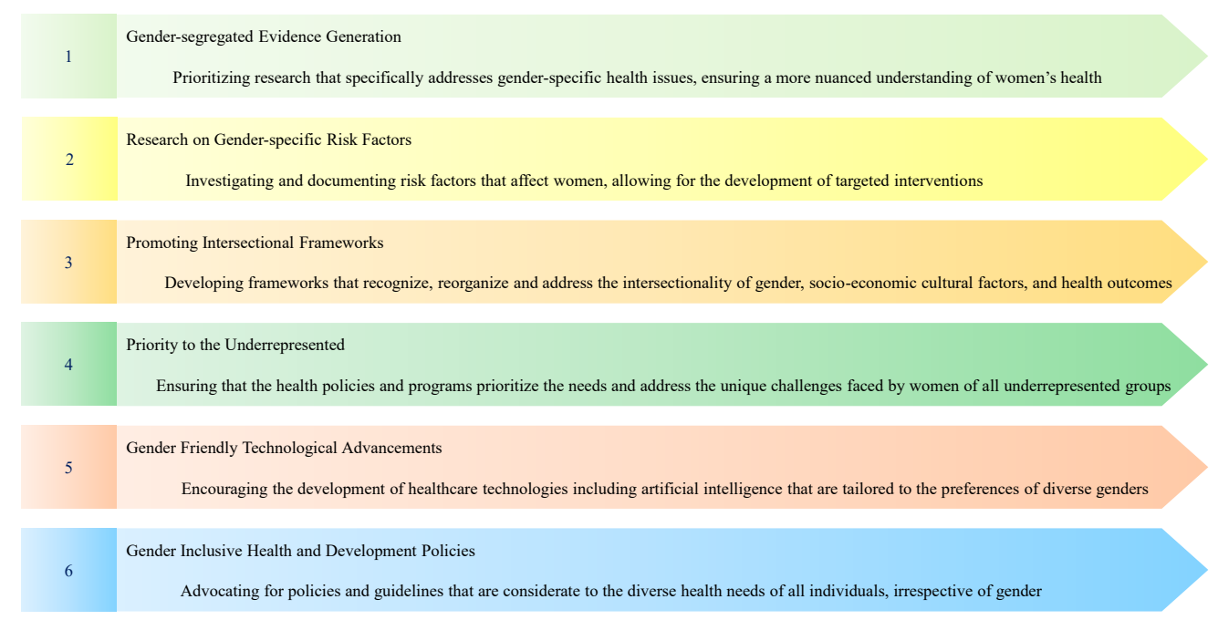
Fig. 2. Recommendations to address women's health issues beyond reproductive health.

issue more sensitively<sup>24</sup>. This would require policy and decision-making to include significant representation of stakeholders, namely, women from various socioeconomic and regional backgrounds. Particularly in India, schemes like the Model Rural Health Research Unit (MRHRUs) that envision technology transfer to rural areas have the potential to become the flag-bearers of gender-equitable healthcare and holistic research. Such institutions, with active community engagement, can lead the multi-sector consortiums on women's health, ensuring that no woman, irrespective of ethnicity or background, is left out.